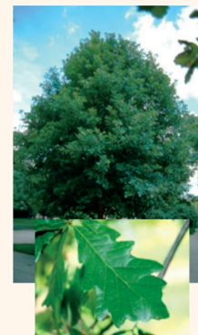
Swamp White Oak