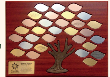
Recognition Plaque at Village Hall.